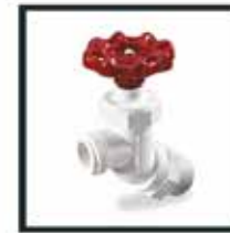
Hose, Tube, Fittings &