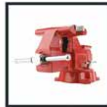
Clamping, Workholding & Positioning