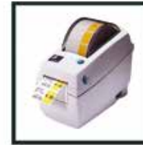
Marking & Labeling