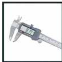
Measuring & Inspecting