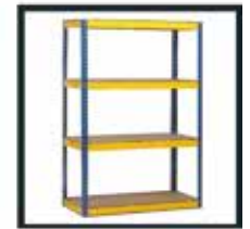
Material Handling &