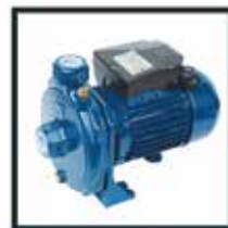
Plumbing, Pumps & Filtration