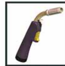
Welding & Soldering